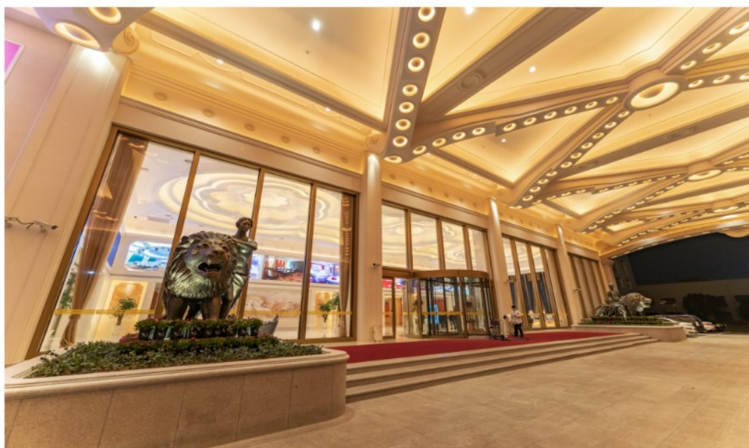
Hotel rain lounge

The Shanghai Minhang Platinum Hanjue Hotel is located approximately 2.5 kilometers from the venue. The hotel's address is No. 1577, Humin Road,